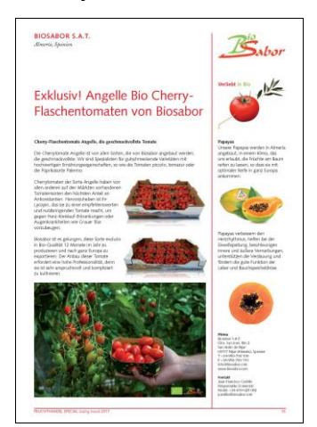
Main text 900 characters Secondary text 650 characters