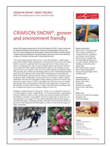
Main text 2.250 characters Secondary text 800 characters