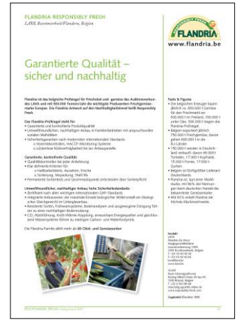
Main text 1.500 characters Secondary text 900 characters